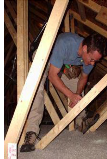
Lightly Treading staff member measures attic insulation.

Home energy audits through Xcel account for approximately 92% of their work consists of HERS Ratings, work on the Home Performance with ENERGY STAR programs, energy efficiency workshops, training certifications, system-specific diagnostic testing, and other services.