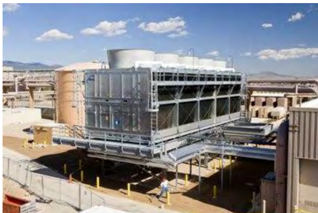
Cooling towers.

The building itself received LEED Silver certification. Rather than build a new structure, IBM retrofitted an existing office building, reusing 98 percent of the original building's shell, recycling 65 percent of the materials from the original building, and sourcing 25 percent of newly purchased material from recycled products.