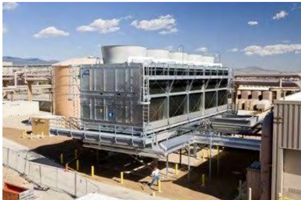
Cooling towers.

The building itself received LEED Silver certification. Rather than build a new structure, IBM retrofitted an existing office building, reusing 98 percent of the original building's shell, recycling 65 percent of the materials from the original building, and sourcing 25 percent of newly purchased material from recycled products.