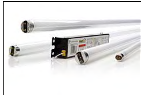
Energy efficient lamps and electronic ballast.

Colorado Lighting replaced all the metal halide fixtures with T8 fluorescent fixtures, and installed motion-controlled switches. Because the facility is involved with food service and processing, GE covRGuard lamps were used throughout. (These more expensive lamps have a polycarbonate coating on the tubes to contain broken glass) The new fixtures were located strategically to retrofit the facility. The new fixtures were wired and mounted in such a way that they can be easily moved if another tenant with different lighting needs moves into the facility at a later date.