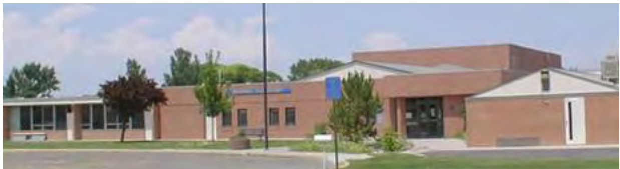
One of 79 MCVSD buildings receiving energy-efficient lighting upgrades.

Indeed, this large-scale institutional energy efficiency project creates a win/win/win scenario for everyone involved. Students, teachers and staff get a better working and learning environment; Colorado contractors, distributors and installers get lucrative business. The school district and Mesa County taxpayers save money without having to invest scarce financial resources in energy efficiency. The utilities make progress toward their mandated energy efficiency targets, and the Colorado environment benefits in a myriad of ways from reduced energy use, pollution and greenhouse gas emissions.