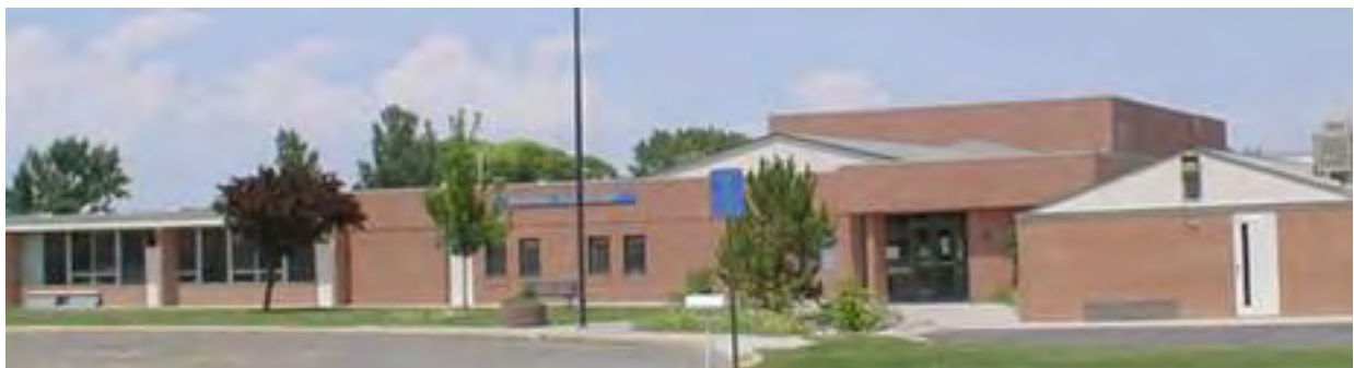
One of 79 MCVSD buildings receiving energy-efficient lighting upgrades.

Indeed, this large-scale institutional energy efficiency project creates a win/win/win scenario for everyone involved. Students, teachers and staff get a better working and learning environment; Colorado contractors, distributors and installers get lucrative business. The school district and Mesa County taxpayers save money without having to invest scarce financial resources in energy efficiency. The utilities make progress toward their mandated energy efficiency targets, and the Colorado environment benefits in a myriad of ways from reduced energy use, pollution and greenhouse gas emissions.